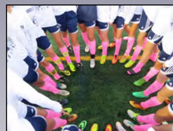
Varsity Girls’ Soccer created a beautiful rainbow while supporting POB’s Coaches vs. Cancer Week. The Hawks went 10-5-1 and qualified for the playoffs.