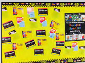
Bulletin Board in Mattlin about "Step Up and Speak Out" against Bullying.

The ACSL program is brought to us by the Louie Acompora Foundation.