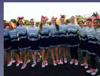
Middle School Cheerleaders supporting our Coaches vs. Cancer Week by wearing Pink Bows and Pink Shoelaces. Great Job Girls!

Congratulations to all of the athletes and coaches.